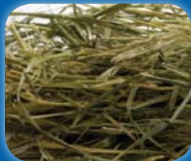
Help Stabilization • rip rap for stream banks seed/straw • matting hydroseeding

DO take the following steps to better your community and help you save money: