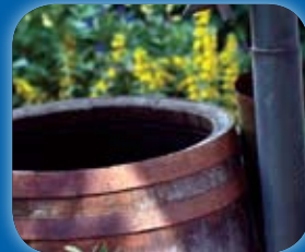
Put in a Rain Garden