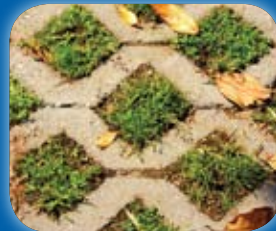
Install Permeable Pavement