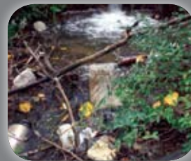
Pollute the environment Tire Dumps • Household Garbage • Chemicals