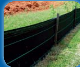
Best Management Practices silt fence • check dam drop inlet protection

DON'T allow the following practices that harm your environment: