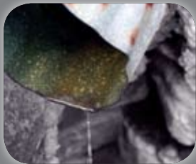
Allow Discharge pipe to creek from gutters • downspouts or sewer

DON'T allow the following practices that harm your environment: